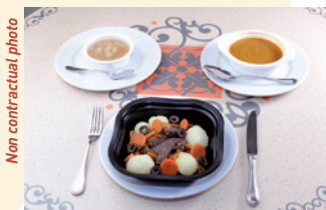
Sample “allergen-free” meal

The restaurants listed on page 5 offer a choice of two starters, four main courses and three desserts . The list of ingredients used is exhaustive (meaning that there are no “hidden” ingredients).